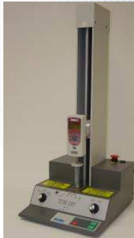
TCM201 with DFE Series digital force gauge